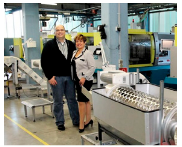
One part of NORWE's extensive machinery: ca. 120 million coilformers were manufactured on the injection molding machines in the past year.